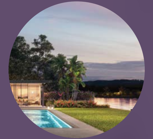
LARGE PRIVATE PLOTS