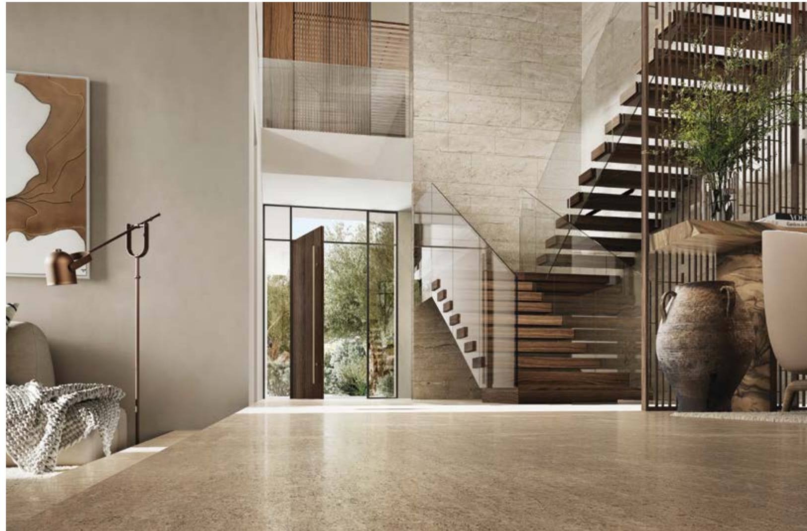
ALAYA 6-BEDROOM GRAND ISLAND VILLAS