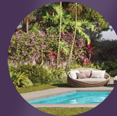
LANDSCAPED GARDEN OPTION