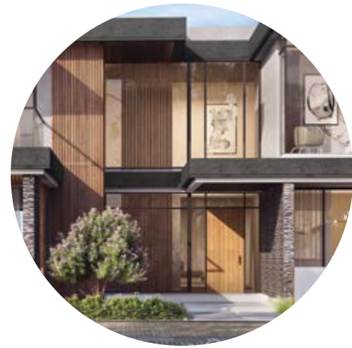
IMPRESSIVE DOUBLE HEIGHT ENTRANCE