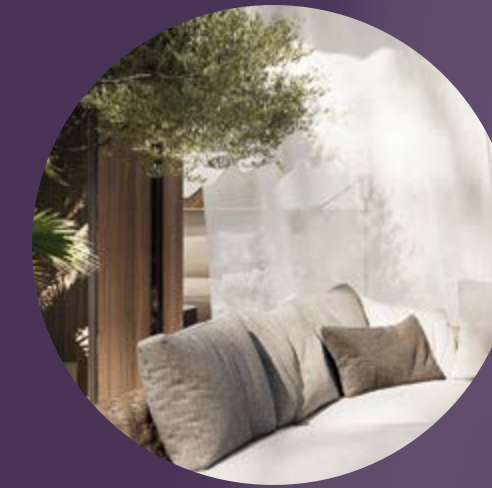
SHADED TERRACES AND BALCONIES