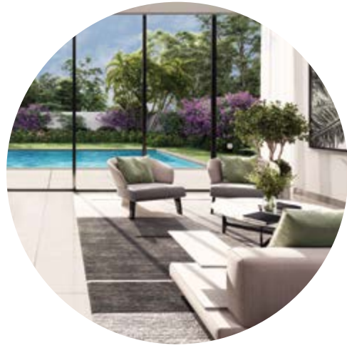
OPEN PLAN LIVING