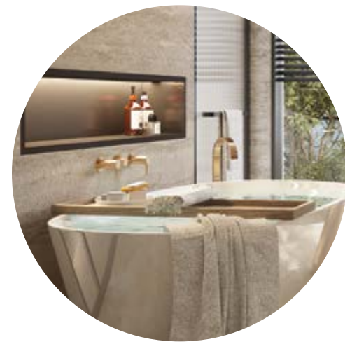
SPA-STYLE EN SUITES