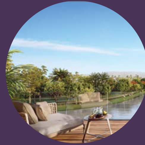
STUNNING WATER VIEWS