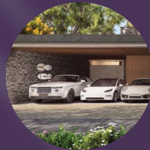
GENEROUS GARAGE SPACE