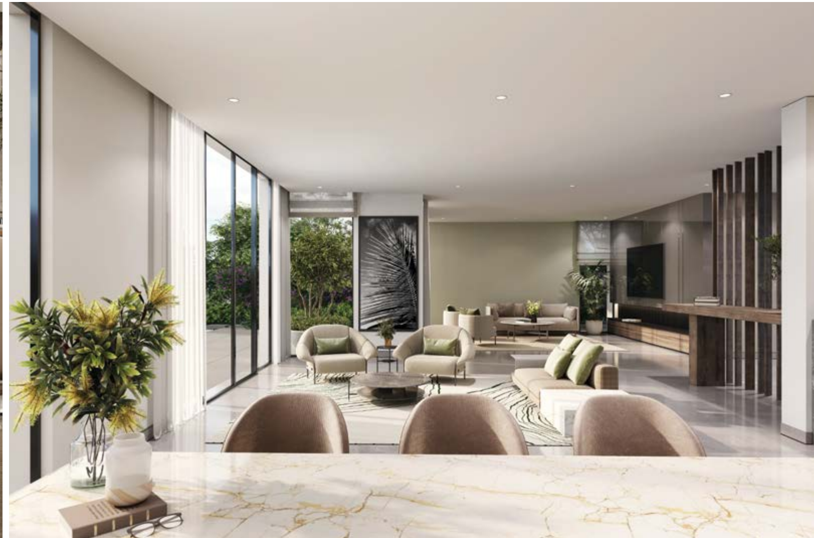
AYANA 6-BEDROOM SERENE ISLAND VILLAS