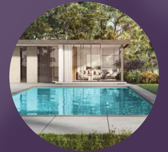
PRIVATE POOL OPTIONS