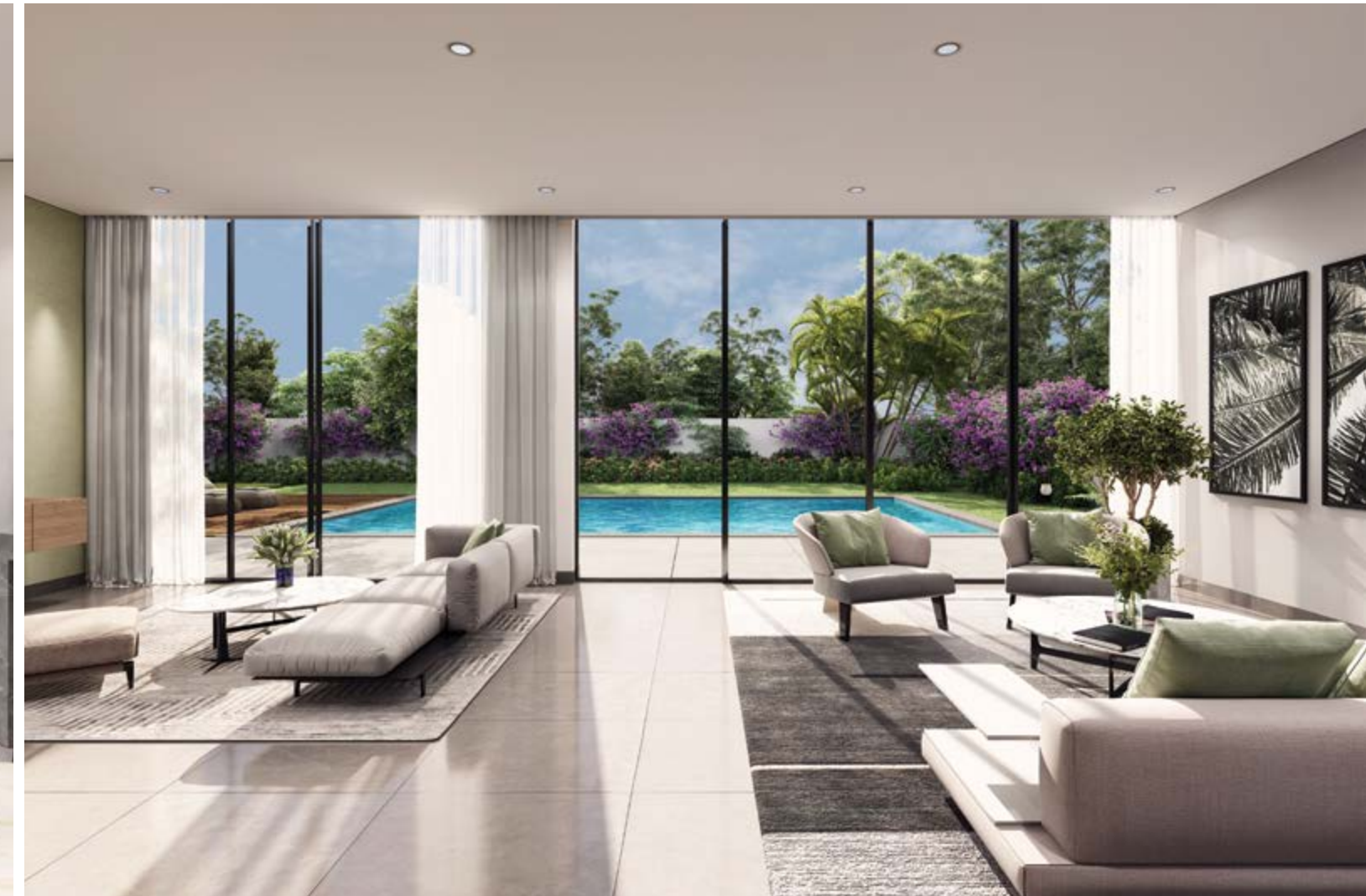
AMARA 5-BEDROOM EXCLUSIVE ISLAND VILLAS